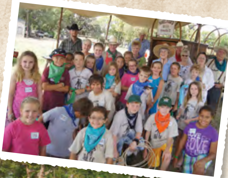
Say, "Biscuits!" Campers huddle up for a group photo.