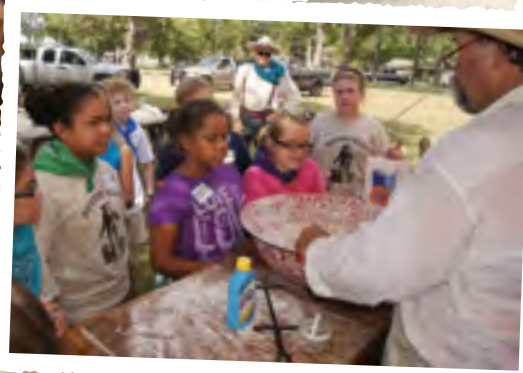
Can we eat yet?