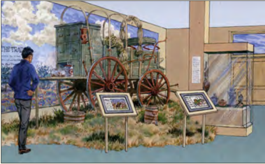
Exhibit Team Envisions Visitor Experience: A Trail Ride in Time

The Chisholm Trail Heritage Museum aims to put visitors right in the well worn saddle of the American cowboy. Our museum's mission is to preserve the vivid, true-to-life stories of the cowboy and the era of the great cattle drives.